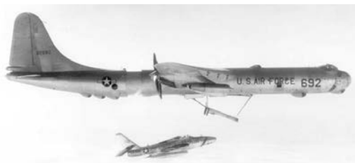
A GRB-36 Bomber launching a BFB-84 from the bomb bay.

On 4 November 1954, HQ USAF redesignated the wing as the 71st Strategic Reconnaissance Wing (Fighter) and stationed the 71st at Larson AFB, Washington. The wing performed strategic reconnaissance and also tested a technique for launching small aircraft from bombers to extend the range of photographic reconnaissance and fighter escort. The testing ended in 1956.